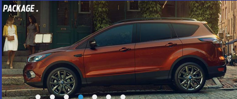
2017 Ford Escape

I want this car because I really like this kind of car and it would be very good for travelling when I have to go to my friends houses, to the store or to the dentist and doctor.